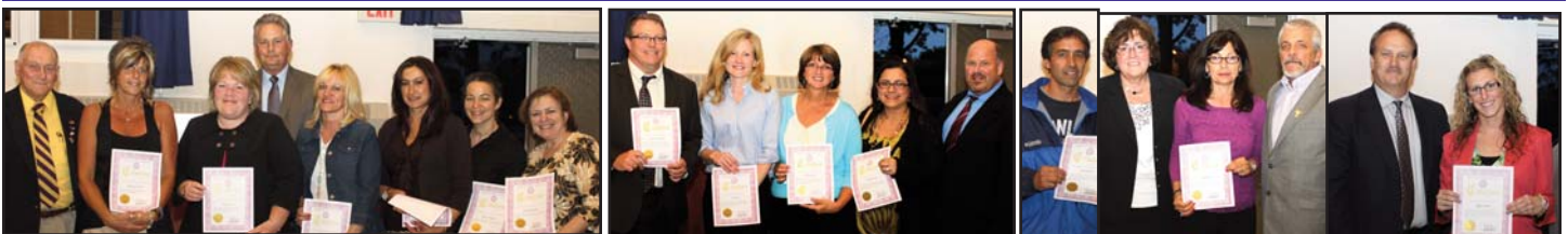
(above) BOE RECOGNITION given to staff mentors, advisors, councilors, and volunteers. (SEE FULL LIST ONLINE)