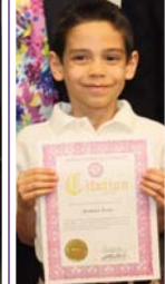
(above) • SD raised $250 for Ronald McDonald House