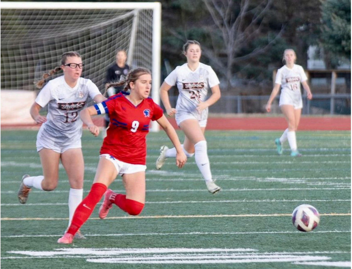
Girls soccer earned a hard-fought home victory over Erie 2-1