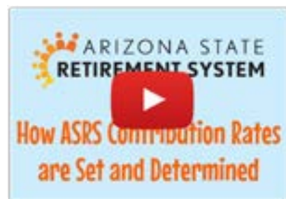
Watch our video on contribution rates at AzASRS.gov/content/contribution-rates

While these experience studies don't outline exactly what future contribution rates will be, it does serve as an important piece of the puzzle that we use to determine a path forward, with the goal of continuing to be a healthy, properly funded retirement system.