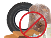
WOOD, WASTE, OR TIRES