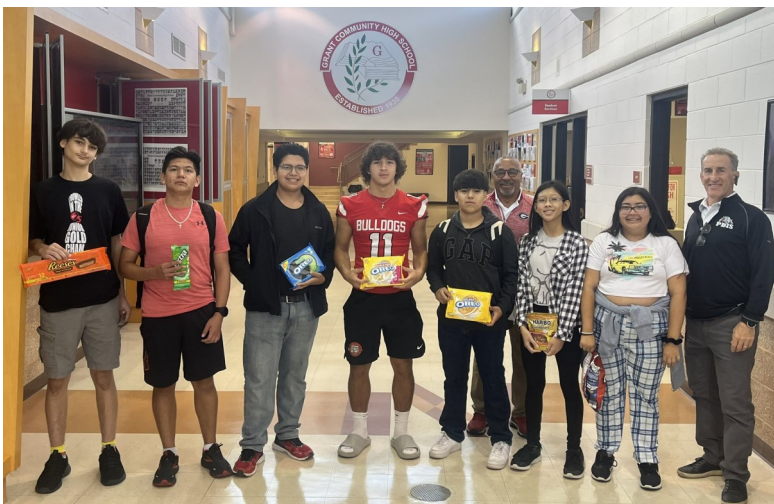
Bulldog Buck Winners—October 5