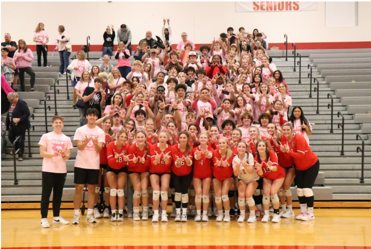
Varsity Volleyball Team & Pink Out Fans

The Girls Volleyball program held their pink out and Volley for the Cure game on September 28, 2023, against Wauconda. In this Battle of the Bulldogs match, Grant walked away with wins at the Sophomore, JV, and Varsity level. With the help of some incredible parents, staff, community members, and local businesses, the program was able to raffle off many items and raise over $1,200 for Volley for the Cure!