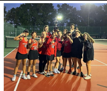
Girls Varsity Tennis Places First at Spirit of the Northwest Tournament

The Girls Tennis team has been racking up wins left and right this season. Early in the season, the JV team took 2nd Place at their home tournament and continued to impress among the NLCC as they took 2nd Place at the Grayslake Invite. Varsity competed in the Spirit of the Northwest tournament at Lakes and came away with three wins for doubles and an overall team victory. Following their spirited win, the team traveled to Zion for a quad and brought home another 1st Place win! Wish these athletes luck as they prep for IHSA Sectionals on Friday, October 13 at Warren Township High School, and make sure to follow them on Instagram ( @granttennis124 ) and X ( @GrantCHSTennis ).