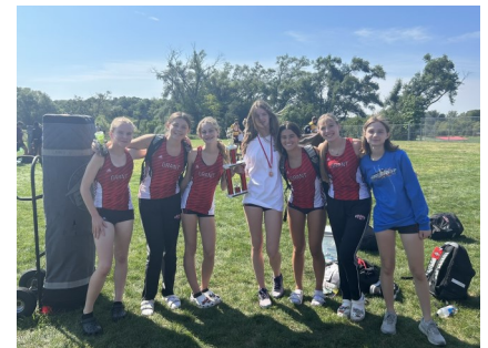
Girls Freshman-Sophomore Cross Country Team Places First at JT Invite

Follow the Cross Country program on X ( @grantxcbulldogs ) for more runner/race information as they near the end of their season.