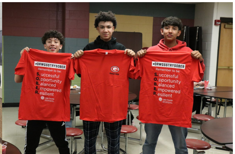
Students participate in the #DawgsStaySober activity to help the Lake County Health Department better understand how high school student respond to their anti-alcohol/drugs marketing.