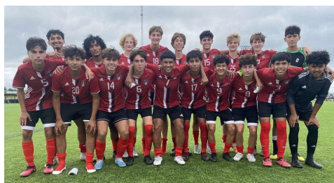
Boys Varsity Soccer Team

The Boys Varsity Soccer team kicked off the season on a high note as went undefeated in the Auburn Invite and won the Pool B Championship. In their home tournament, the team started off with a big win over Cary-Grove. Vernon Hills proved to be tougher and the Bulldogs fell short of a win. They bounced back in their match against Harvard, ending the night with three goals. Outside of their tournaments, the team has been making a name for themselves in the NLCC by taking down Grayslake North and Round Lake. The program still has regular matches on the schedule this season and Varsity will start their State series on Friday, October 20