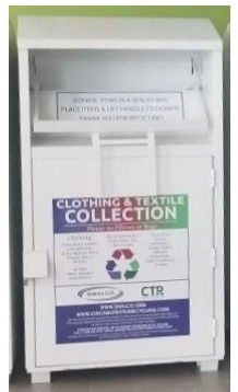
Textile collection bin

With limited landfill capacities and a mission to deter materials from them, the Environmental Club is looking for your help to fill our SWALCO bin. This full-circle program allows community members to discard of their used clothing without polluting the environment and gives them the opportunity to support environmental education/outreach. If you have any unwanted or outgrown Halloween costumes, tote bags, backpacks, or other clothing items, stop by our SWALCO bin off of Devlin Road to drop them off. All items must be bagged and make sure to check their acceptable/unacceptable items list before donating.