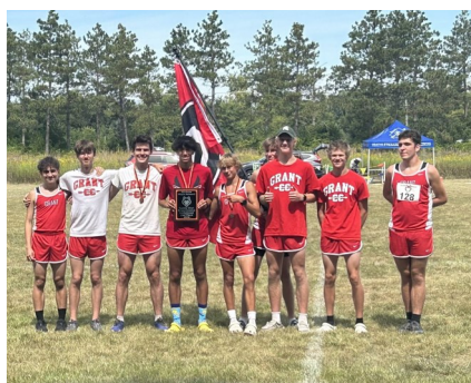
Boys Varsity Cross Country Team Places Second at Harlem Invite

Check out the Girls Golf and Boys Golf teams on social media to stay up-to-date on their 2024 season.