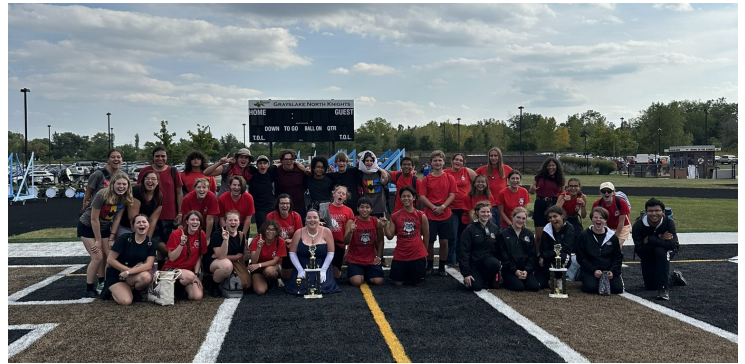
Marching Bulldogs Place First at Grayslake North Knights Marching Competition

The Marching Bulldogs are excited to bring Lights, Camera, Action featuring the music of John Williams to the field this year! They are performing the theme from E.T., Jaws, Superman, and Jurassic Park. At their first competition of the season, the Marching Bulldogs took First Place and earned an award for Best Color Guard. After impressing the judges at the Grayslake North Marching Competition, they were excited to show off their routine at the DeKalb High School Marching Band Championship. It was a chilly Saturday morning on October 7, but that didn't stop them from sweeping their Class and bringing home a First Place trophy, Best Color Guard award, and Best Percussion award! This group of talented Bulldogs have proven that hard work and perseverance do pay off. Congratulations to our Marching Bulldogs and their coaches on two spectacular performances and well-deserved honors!