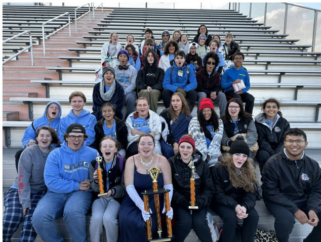
Marching Bulldogs Place First at DeKalb Marching Band Championship