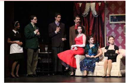
Students perform in the fall play.

Head to the Grant Facebook page for more photos from this performances.