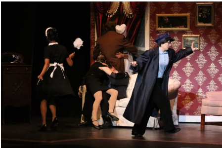
Students perform in the fall play.