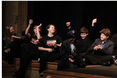
Clue Cast & Crew