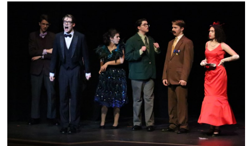
Students perform in the fall play.