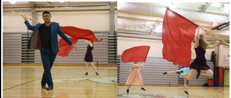
Color Guard members perform at the 2022-2023 NLCC Winter Showcase.