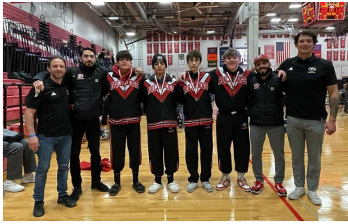
Varsity Coaches & Placed Wrestlers at Barrington Invite