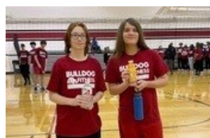
3rd Hour Champions