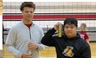
4th Hour Champions