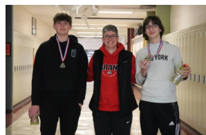
11th Hour Champions