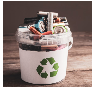
Battery Recycling Bin

The Environmental Club is tackling battery recycling! After doing some research, club members discovered that batteries contain chemicals such as manganese, cobalt, and nickel which are harmful to the environment when not handed properly. When these chemicals leak from discarded batteries, water supply systems and ecosystems in general can be contaminated. To help stop this destruction to our environment, the club has placed several drop-off bins around the school so that students and staff can dispose of their batteries properly. When bins are filled, the Environmental Club will work with Waste Management to pick up the collected batteries. If you have AA, AAA, C, D, or 9-Volt batteries, stop by TSI, the Library, the Math Lab, or the Faculty Lounge and drop them in the bin. By doing your part in taking care of the environment, we can all Keep It RED by Keeping It Green.