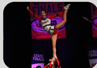
Top & Bottom: Grant Cheer performs at IHSA Cheer State Finals.

Grant Cheer finished their season 15th in the state for the Coed Division!