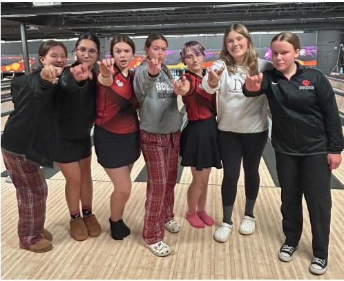
Grant Girls Bowling Sectional Qualifiers