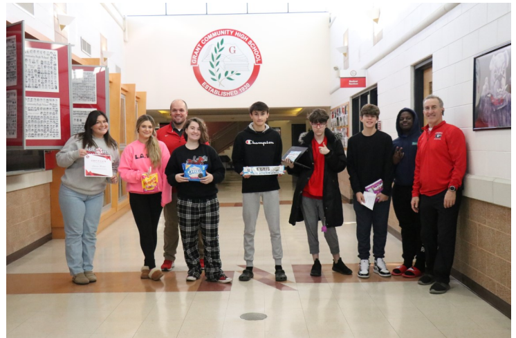
Second Quarter Bulldog Buck Winners