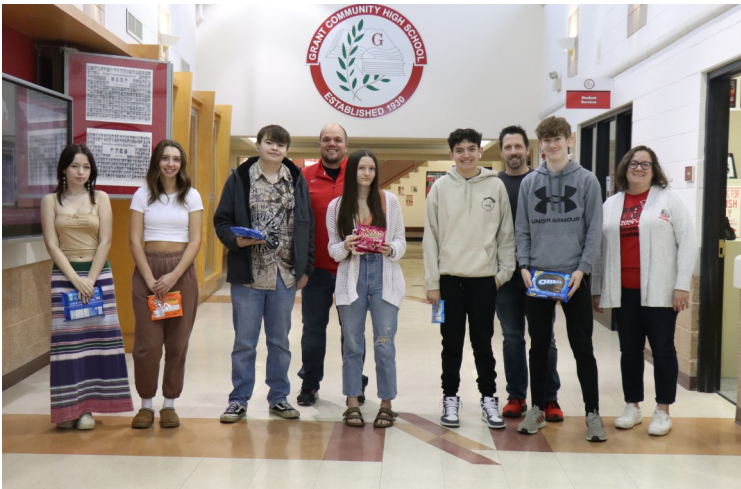
Bulldog Buck Winners from the Week of February 2

To get us all started on the right foot, we challenged our students to another Be On Time Challenge and the Senior Class was determined to win. Within the first two weeks of our challenge, the Seniors became the clear front runner and held onto their lead throughout the final week. With only 220 tardies, the Seniors secured their win along with an ice cream party and Bulldog Cup points. Although the Seniors are earning a grade level reward, we still have individual prizes to award. All students with zero tardies during the course of the challenge will be entered into a raffle to win tickets to the winter dance. Follow us on Twitter ( @KeepingItRED ) for updates on challenge winners.