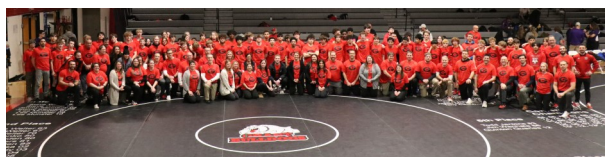
Wrestling Program's Teacher Appreciation Night