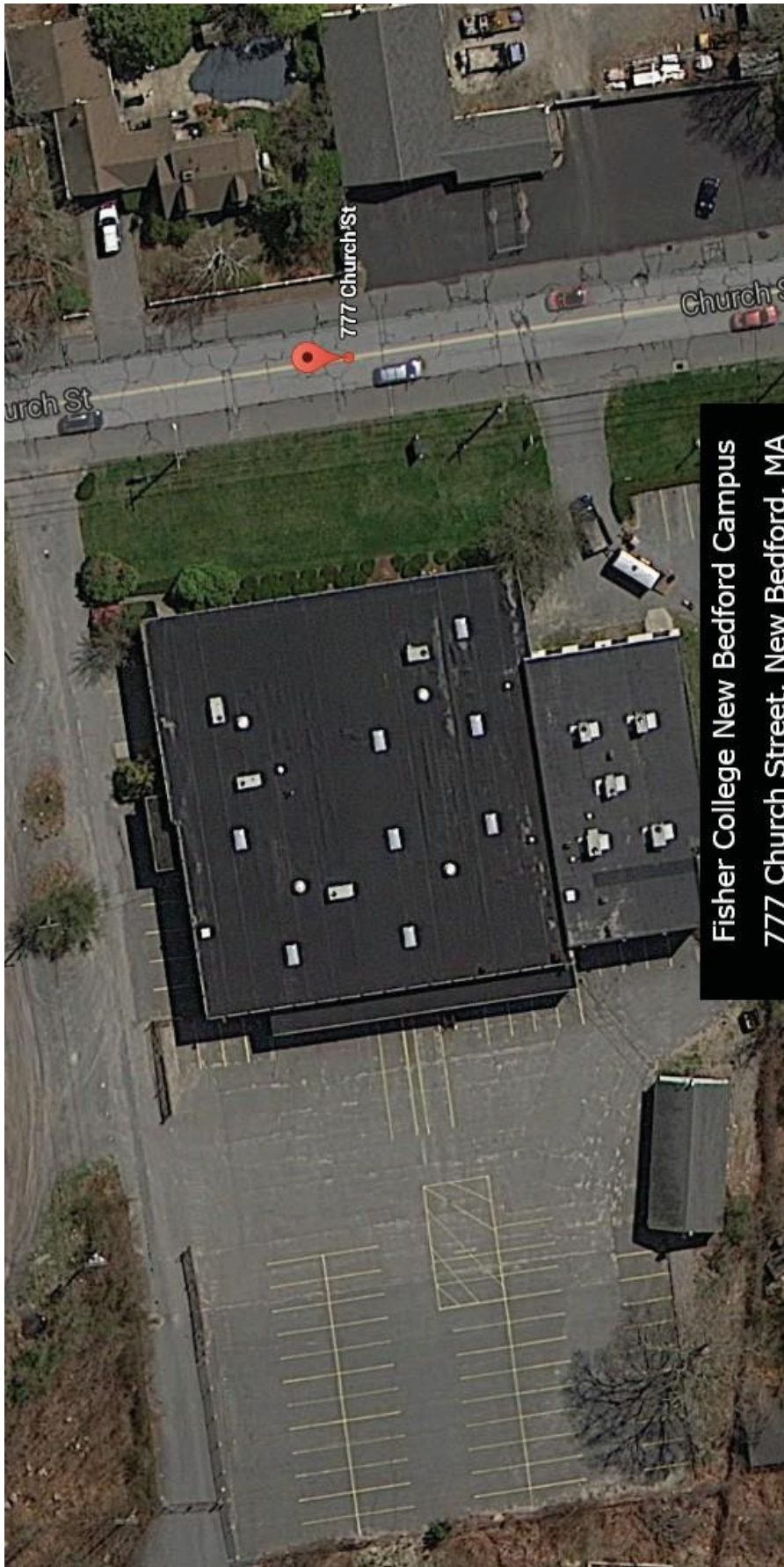
Fisher College New Bedford Campus 777 Church Street, New Bedford, MA

New Bedford Campus closed for 2021 and 2022.