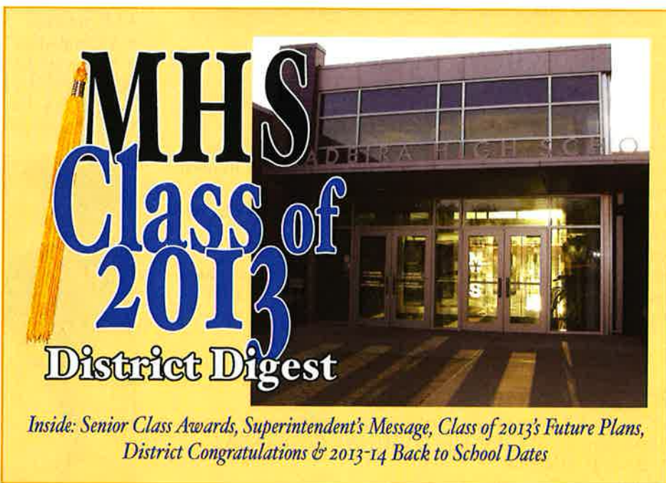
Inside: Senior Class Awards, Superintendent's Message, Class of 2013's Future Plans, District Congratulations & 2013-14 Back to School Dates