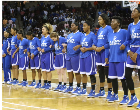
The Girls' Basketball Team are 2016 State Champions