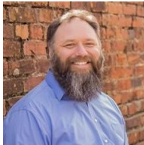
Dreher's Proud Principal

On Instagram: Instagram.com/dreherhighschool