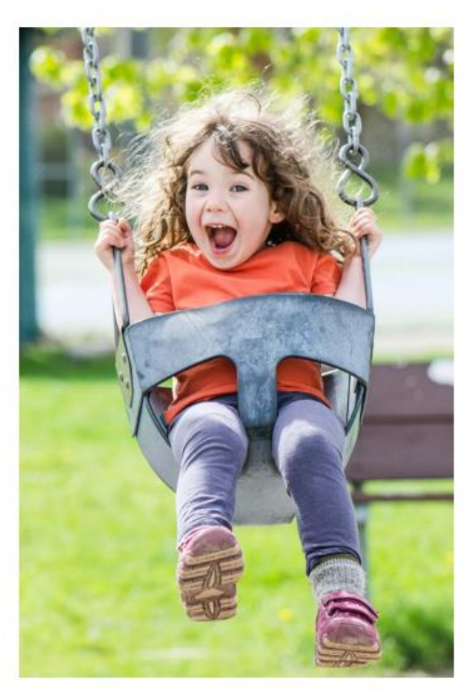
Swings make me happy.