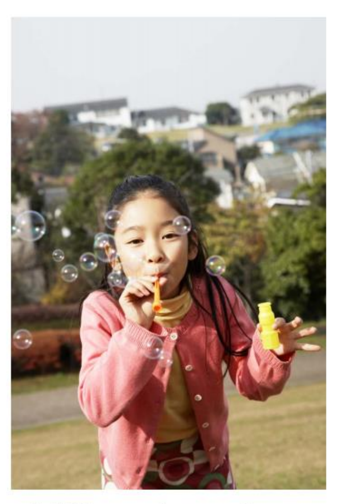
Bubbles make me happy.