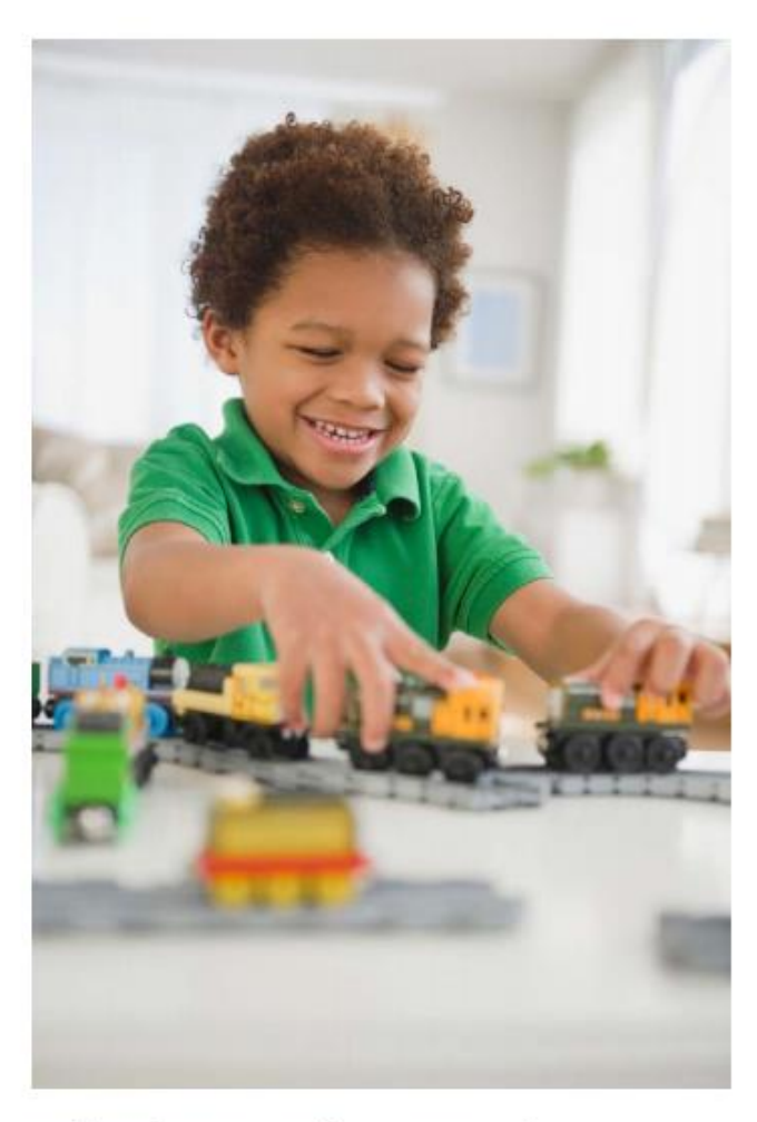
Trains make me happy.