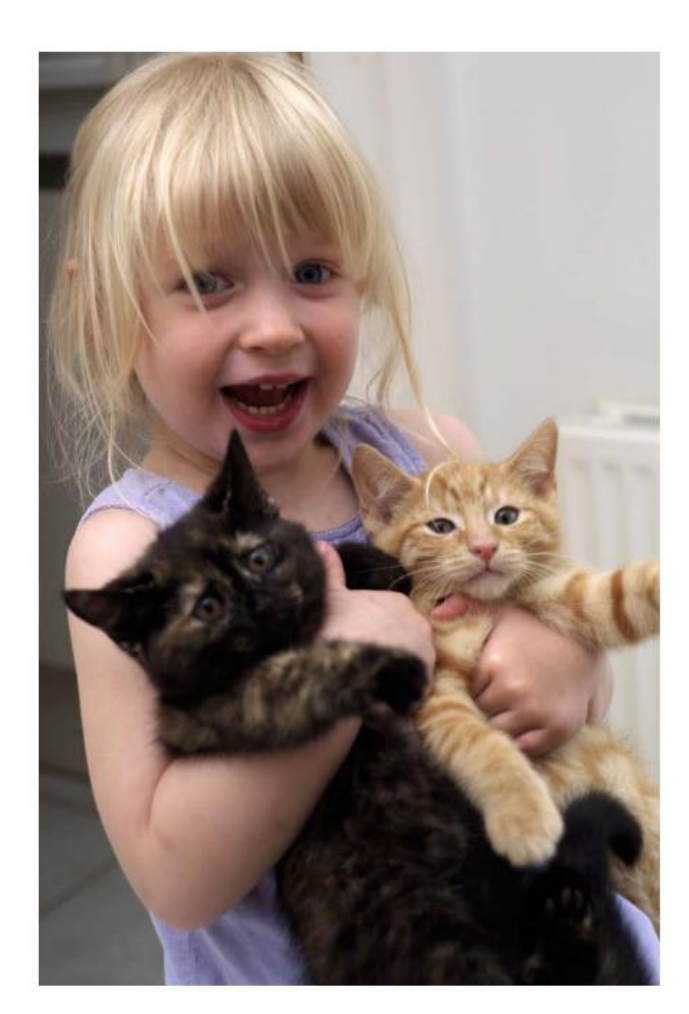
Cats make me happy.