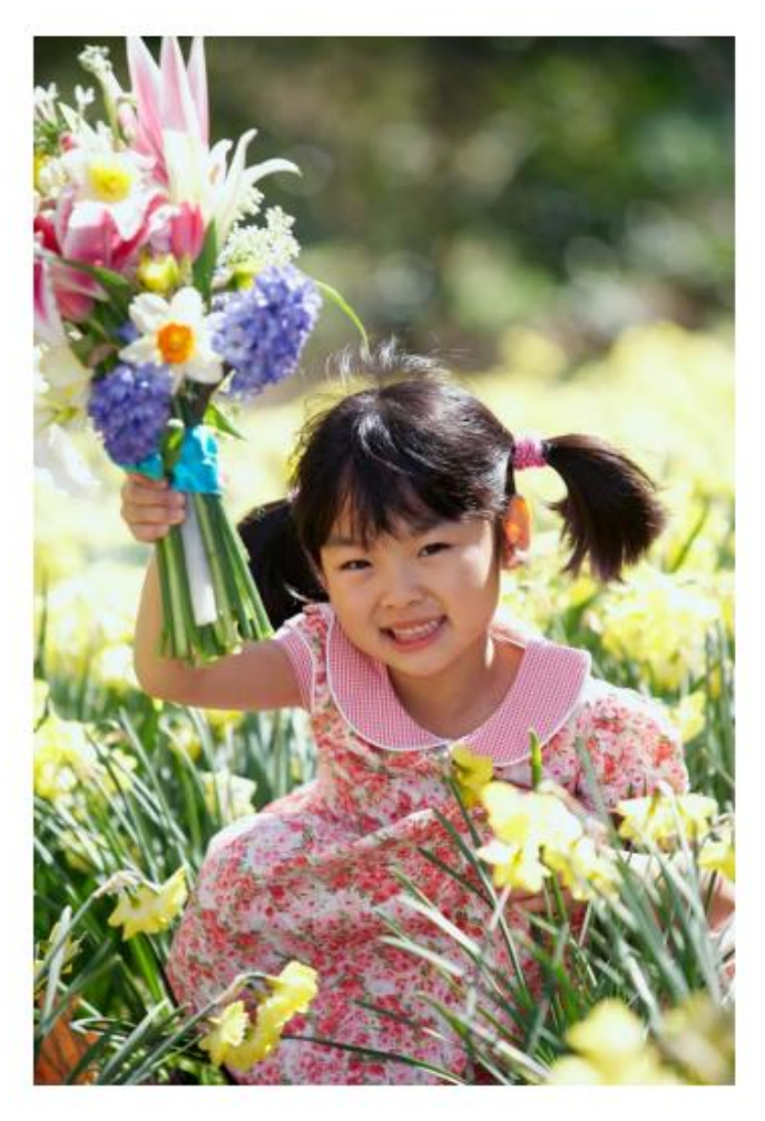
Flowers make me happy.