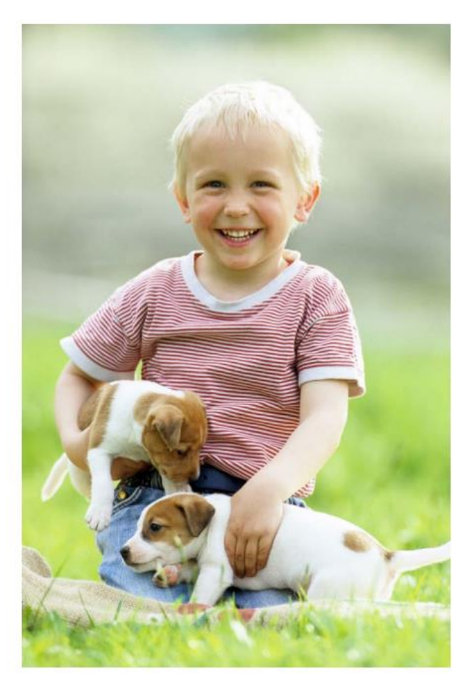
Dogs make me happy.