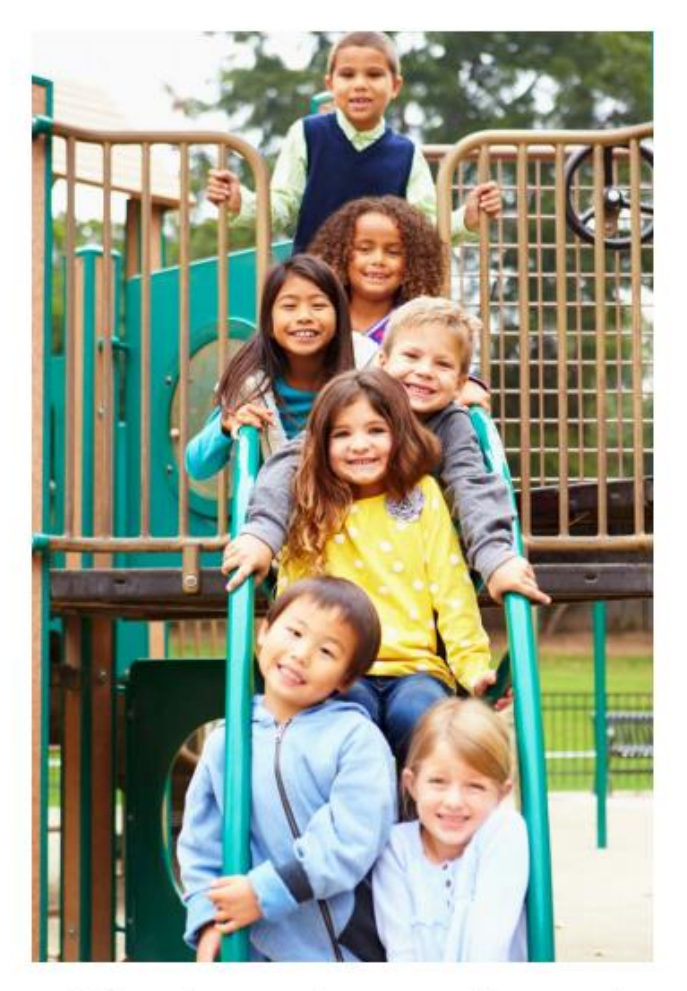
Friends make me happy!