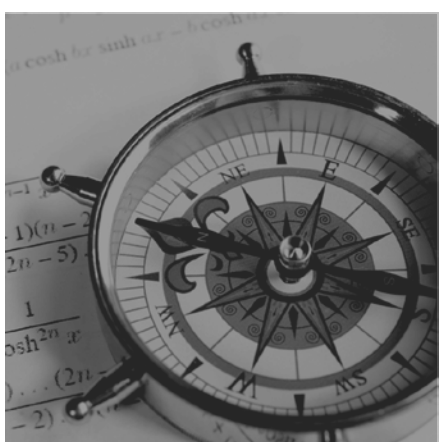
Safety/Security Presentation Board of Education December 12, 2017