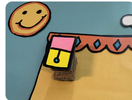
Five layers of cardboard make this window stand out.

Layers of corrugated cardboard can be glued to the back of cut outs to create a 3-D effect.