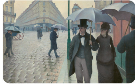
Paris Street; Rainy Day by Gustave Caillebotte, 1890