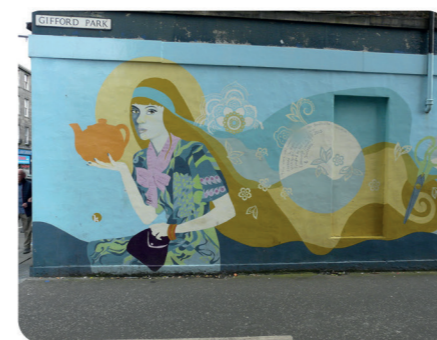
The Gifford Park mural by Kate George, 2015

A mural is a large picture that is usually painted onto a wall, ceiling or other structure.