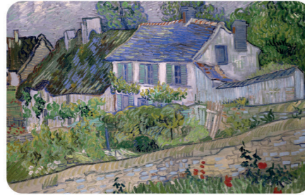
Houses at Auvers by Vincent van Gogh, 1890