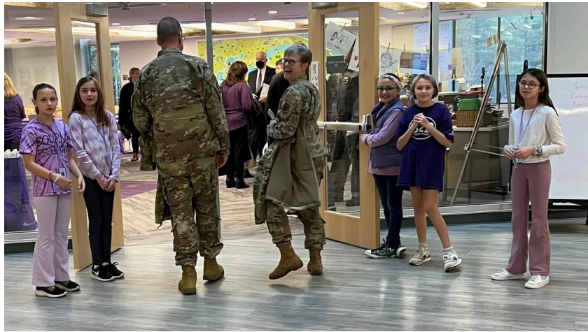
Students welcome military parents at the Purple Up Day event at Bourne Intermediate School.