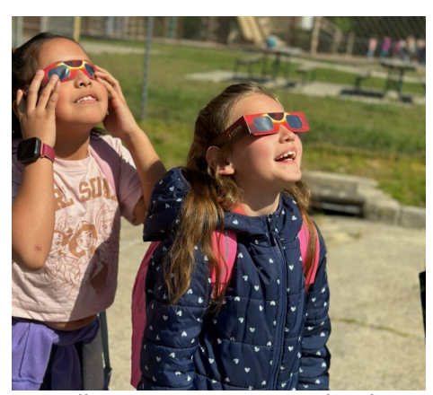
Follow us! @poquosonschools

Come join the PES Cultural Night, Thursday, April 18 from 5-7pm!