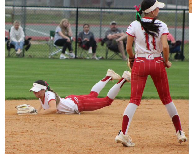
Below: ... and scrambled to her knees to almost throw the runner out at first, but was just a bit late.