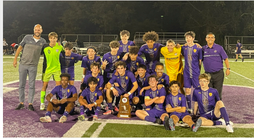
Piper Soccer secures United Kansas Conference Championship

State-Mandated Hearing JBCC Non-Resident Enrollment Policy Monday, November 13 | 6 PM CTE Library | 4410 N 107 St.