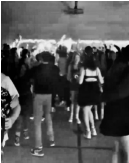
PFA funded 7th and 8th grade dance.

Government funding does not provide enough for all of Foothills' needs. PFA helps to close the gap through fundraising, parent donations, and volunteering. Without the PFA, we would not be able to have many things, such as our social-emotional counselor for two days every week, online learning products for teachers and students, technology, campus improvements, and an Instructional Media Assistant.