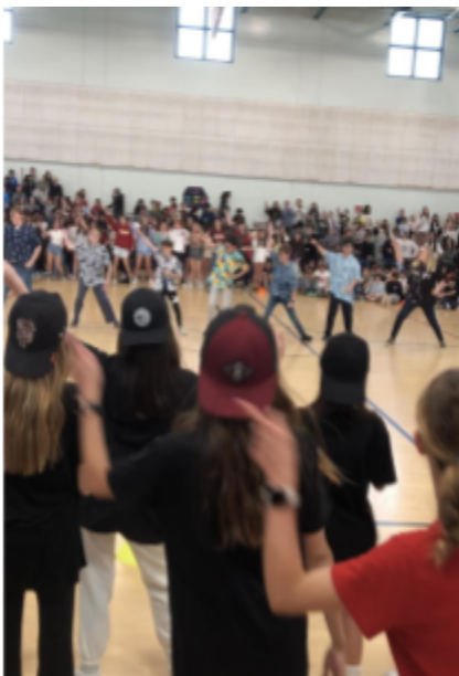
The final dance group dancing to "Stayin' Alive" while the crowd stands up and dances along to the song.