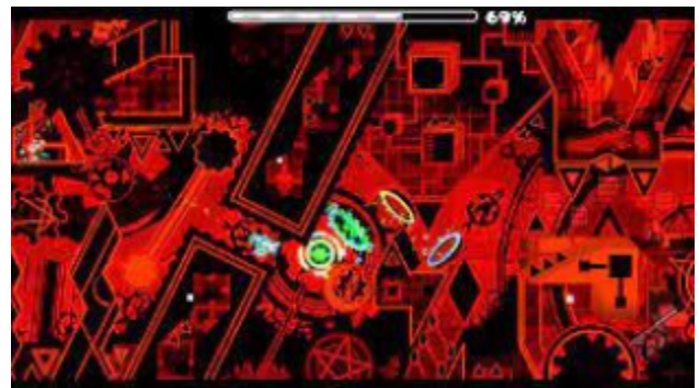
"Aeternus" by Riot and more. (Impossible)

Geometry Dash is available on mobile devices and computers (not Chromebooks). You can download it on the App Store or Google Play on mobile and on Steam on PC. The game costs two dollars to buy. So, if you're still reading this article, stop reading and start downloading!