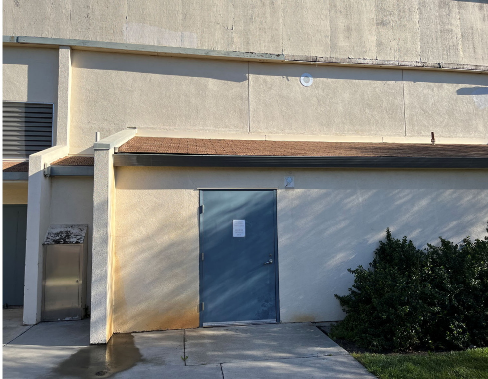
Replace Wood Trim