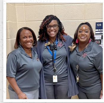
TRIPLETS IN HOWARD POLOS