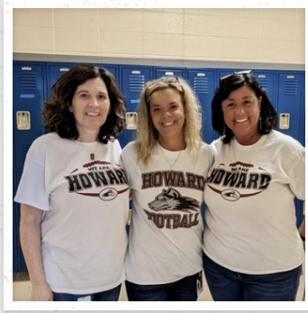
TRIPLETS DAY IN HOWARD TEES