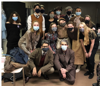
Cambridge High Theatre