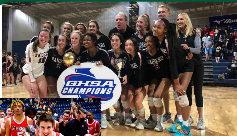
Alpharetta High Volleyball