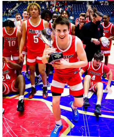
Milton High Basketball