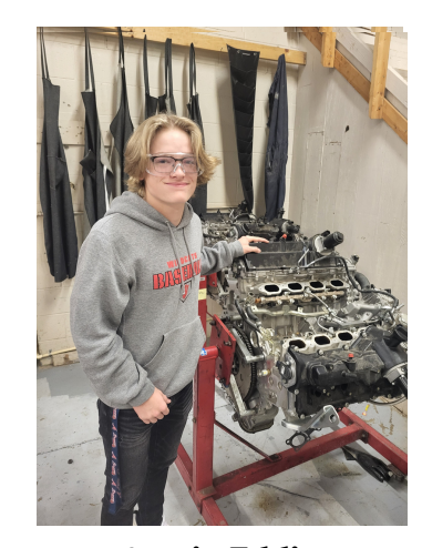
Austin Eddie Automotive