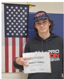
Harley Tribble Automotive