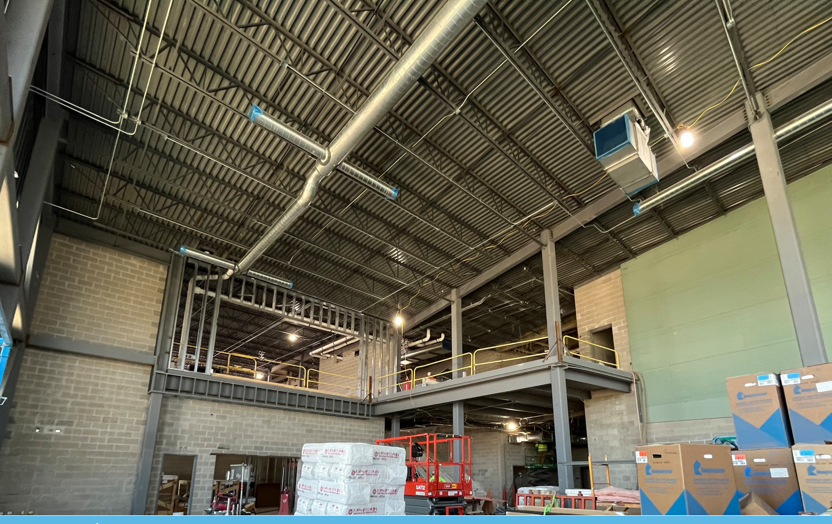
CAFETERIA | FACING THE CLASSROOM AREAS