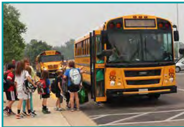
Students at T.C. Martin Elementary School line up to board a school bus at the end of the school day. Parents and guardians can download the Where’s The Bus app. The app allows users to track the location of their child’s bus while getting estimated times of arrival.

School Locator is an online system that allows the public to enter an address and see which three school zones — elementary, middle and high — an address is zoned for. The system also indicates if the address is eligible for bus service, what the bus number is and where the closest bus stop is located. School Locator can be accessed at www.ccboe.com under the Quick Links