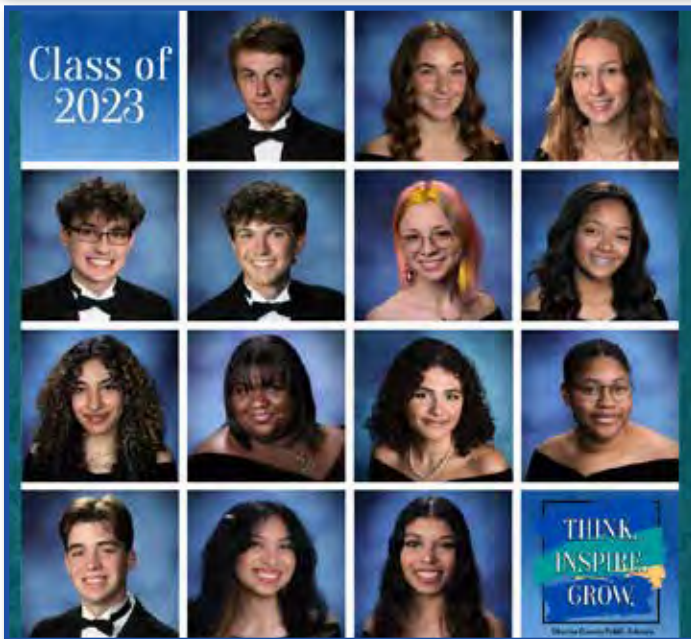
Pictured are the valedictorians and salutatorians for the Class of 2023. Read more about these class leaders on Page 39.

* Students must enroll in and pass a math course every year in high school (COMAR 13A.04.12.01). Electives for students must be completed through one of the following two pathways: two credits of the same world language and three electives; or completion of a state-approved career and technical education (CTE) program and elective credits. The number of elective credits required may differ, depending on the CTE program. Current CCPS juniors and seniors have different graduation requirements. See Page 5 of the 2023-2024 High School Program of Studies or visit the school system website at www.ccbocoe.com .