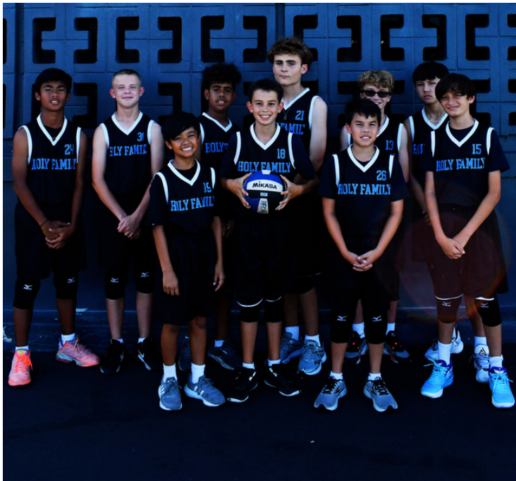
Catholic Schools League - Boys Volleyball