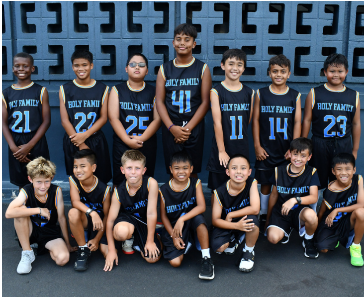
Christian Schools Athletic League - Boys Basketball

Congratulations to all our Wildcat Athletic teams who wrapped up their seasons in October. We are so proud of all your hard work and thank you for representing HFCA. Our girl's volleyball (black team) won the Catholic Schools League championship!