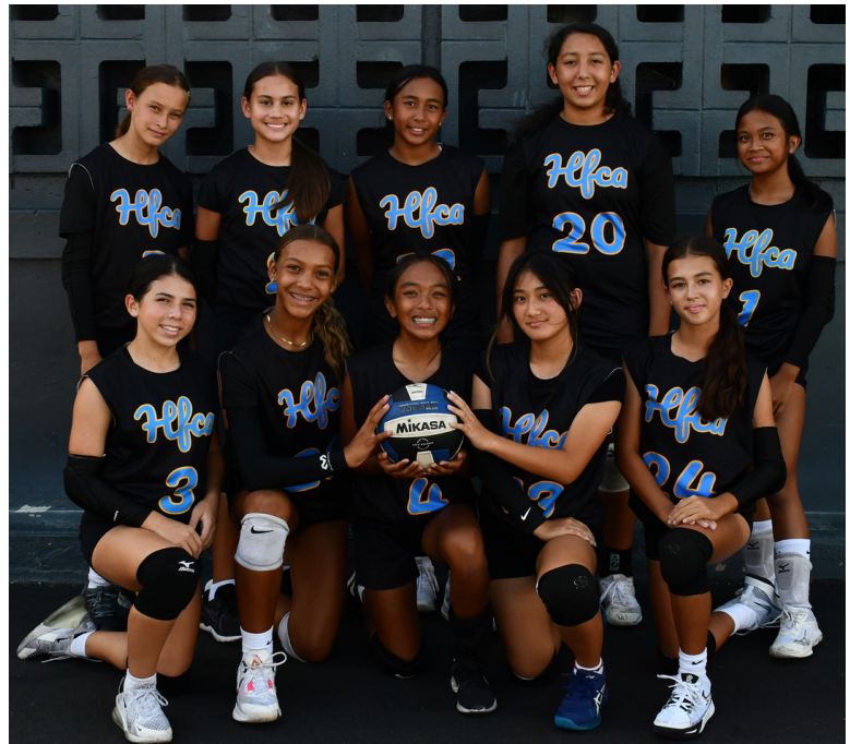
Catholic Schools League - Girls Volleyball (black team)