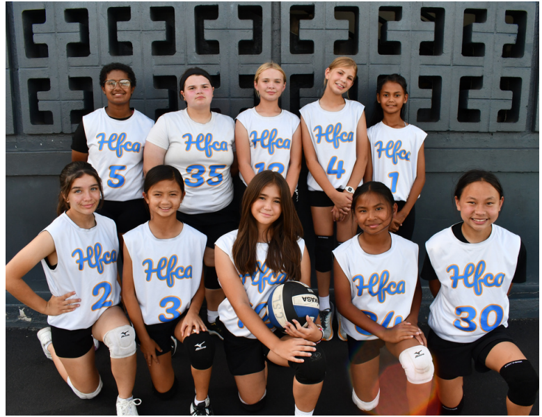
Catholic Schools League - Girls Volleyball (blue team)