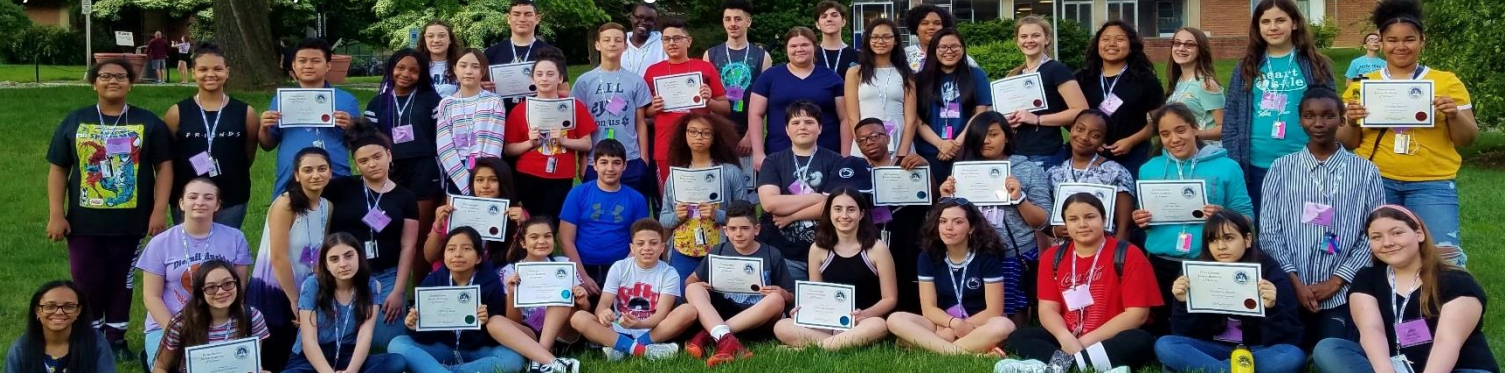
Pennsylvania Junior Academy of Science winners, ASD's largest cohort