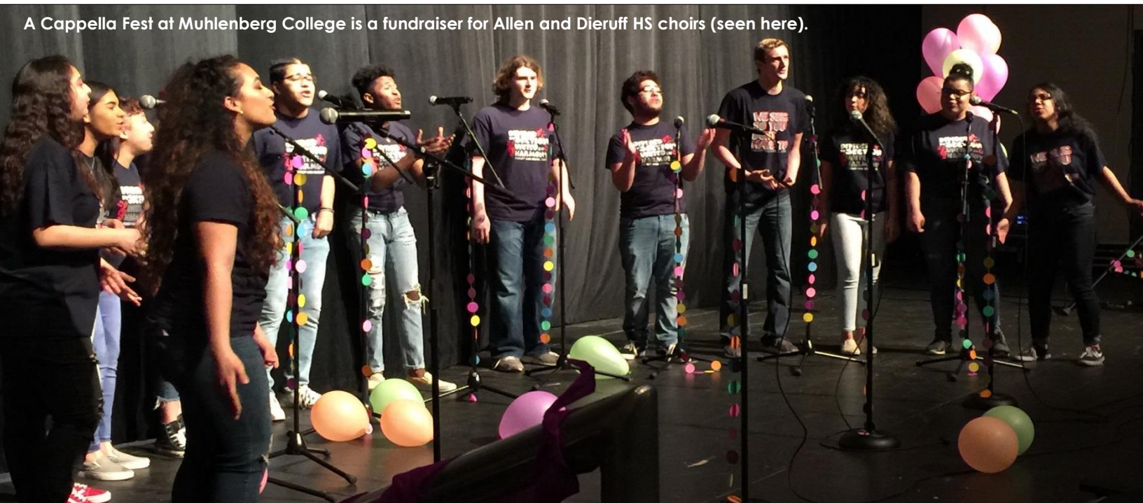
A Cappella Fest at Muhlenberg College is a fundraiser for Allen and Dieruff HS choirs (seen here).