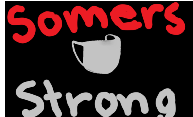
Drawing by Thalia Etelemaki