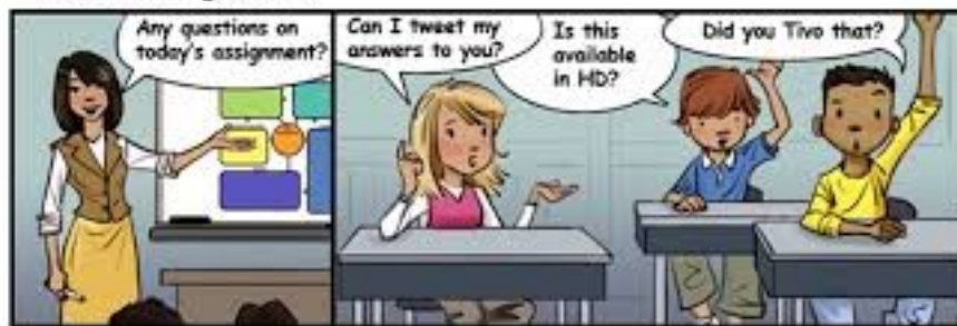
The Learning Curve

I have ended up writing a lot about eLearning in this article but that doesn't mean that your children should do online learning. Human interaction is still important, even during a pandemic!