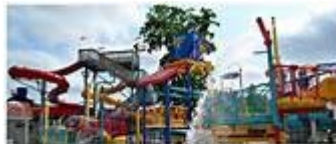
Quassy Amusement Park & Water Park Middletown, CT