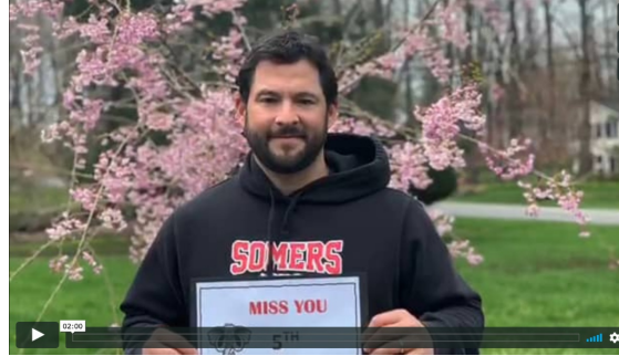
Fifth Grade Team