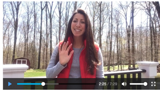
Fourth Grade Team