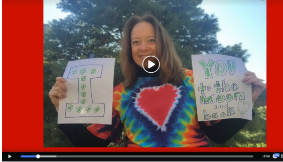
First Grade Team