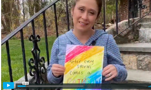
Second Grade Team