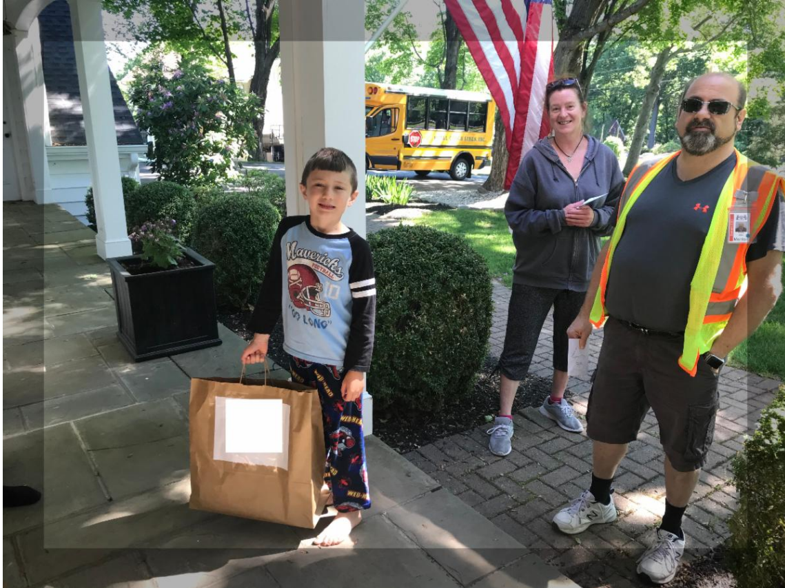
Bus drivers and monitors hand delivered desk and locker contents to students' homes. Teachers and teachers aides gathered all the belongings and packed them up for the special delivery.