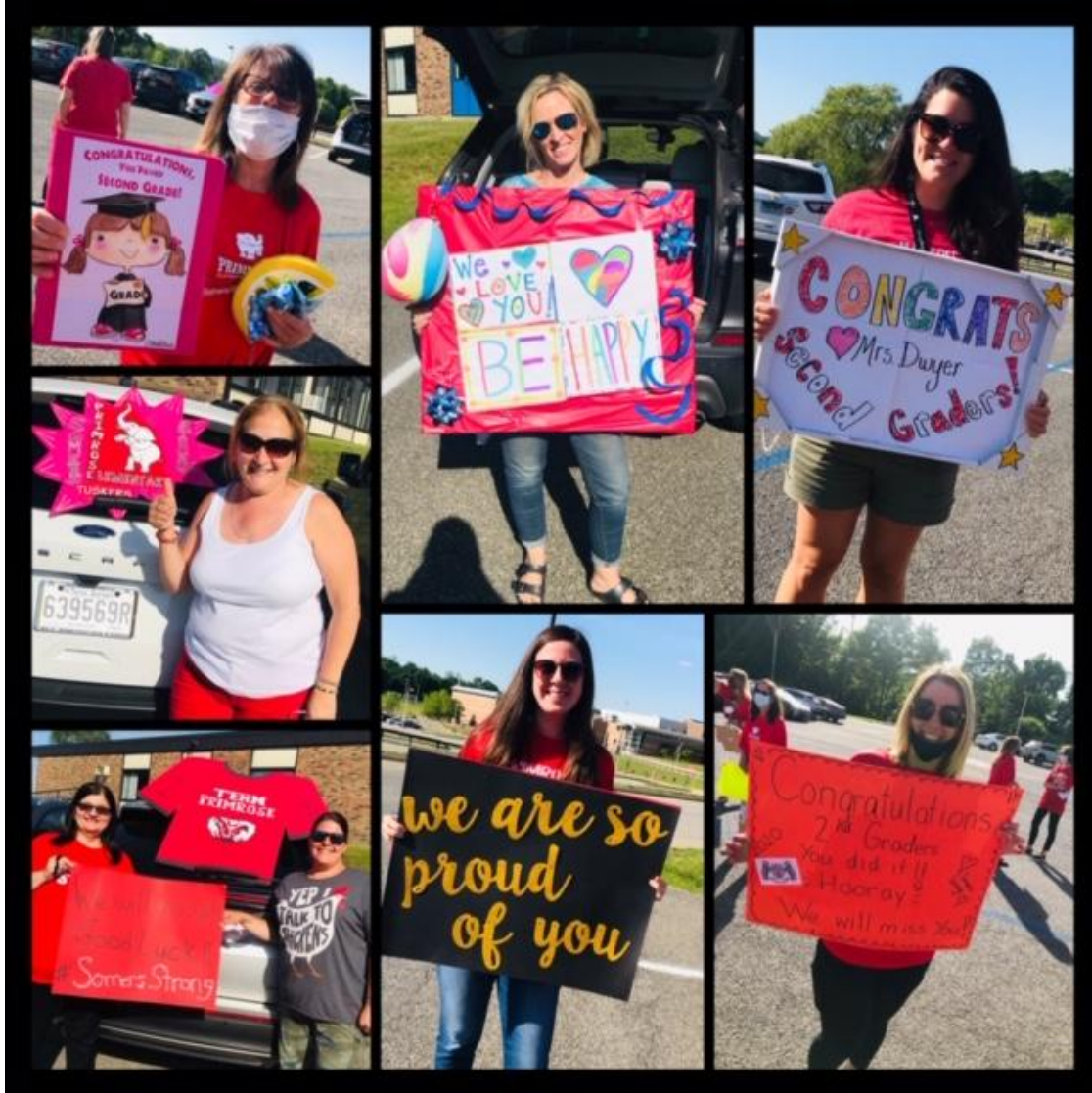
Second-graders from Primrose take a last lap past their school and get a supportive send off from their teachers. Take the drive from a second-grader's point of view.