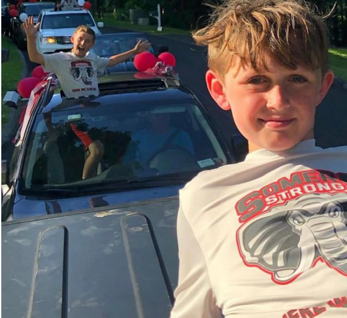
The fifth-graders at Somers Intermediate School got a chance to say goodbye to their teachers and friends before moving across campus to the middle school next year.