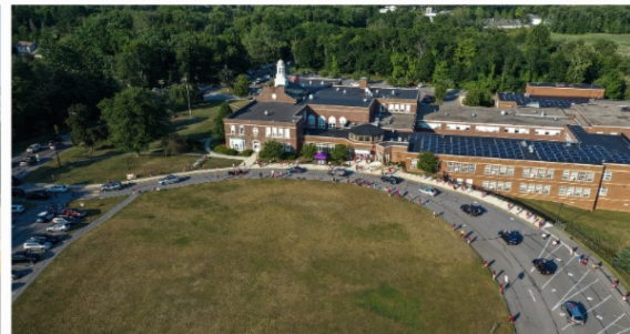
A car parade ended with an energetic send off for the eighth graders at Somers Middle School.