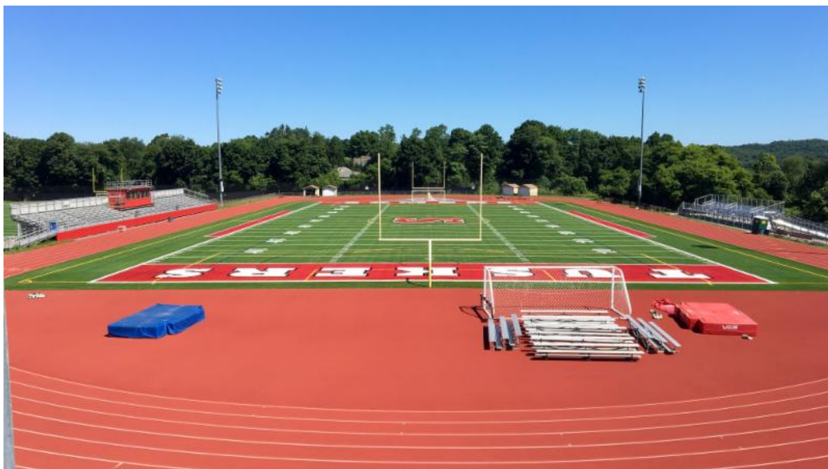
New turf fields, bleachers and a scoreboard are ready for the new year at Somers High School.

Improvement projects are well underway around all Somers Schools, some obvious, others behind the scenes.