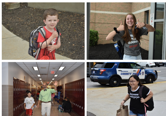
Lots of smiles and excitement on the first day of school.