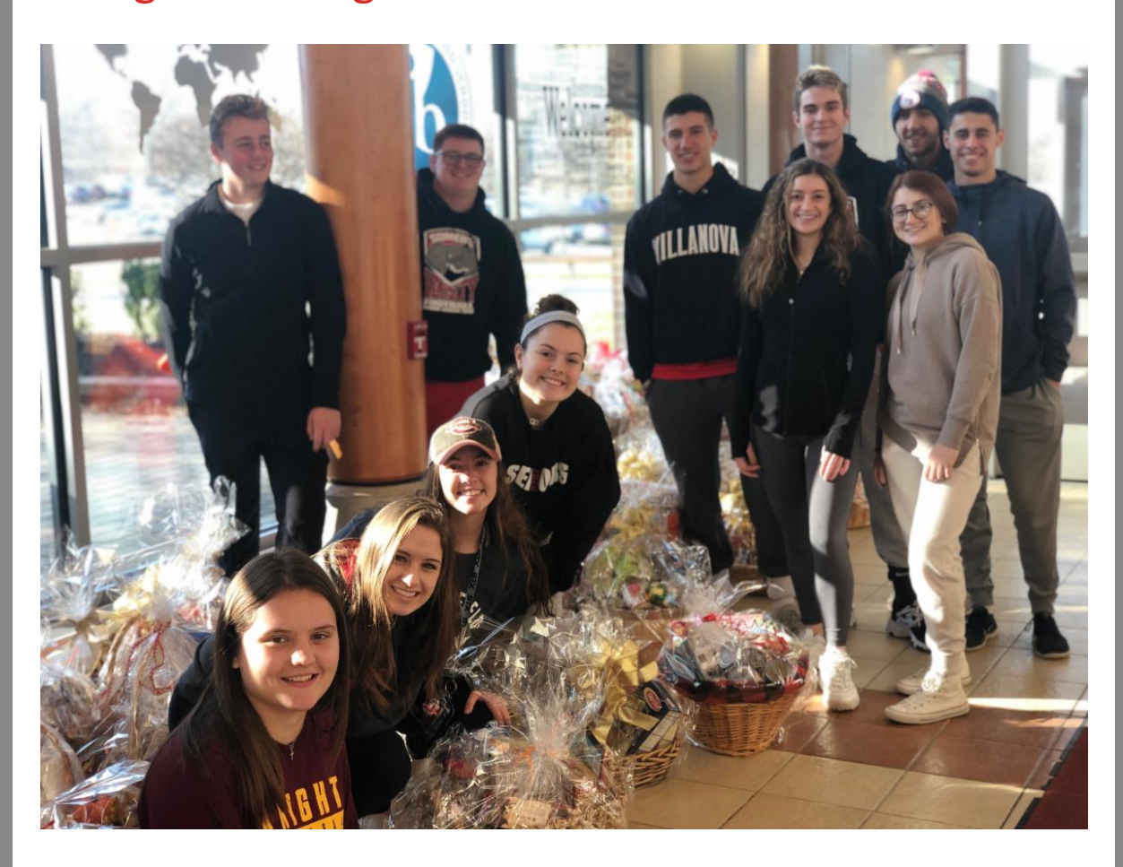
Top, volunteers at the high school wrap Thanksgiving baskets full of food, gift cards, and games. Below, mason jars full of chocolate chip cookie mix created by students and their mentors.

The line stretches from a supply room to the atrium at Somers High School, as students pass boxes and baskets full of food that are loaded into vans, headed for the Thanksgiving food pantry at St. Luke's Church in Somers.