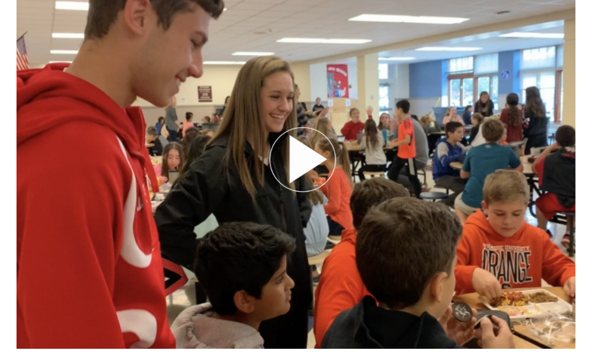
Tuskers Committed is a group of students at Somers High School committed to a healthy lifestyle. Watch these role models connect with middle school students and explain why they are members of Tuskers Committed in this TuskerTube video .