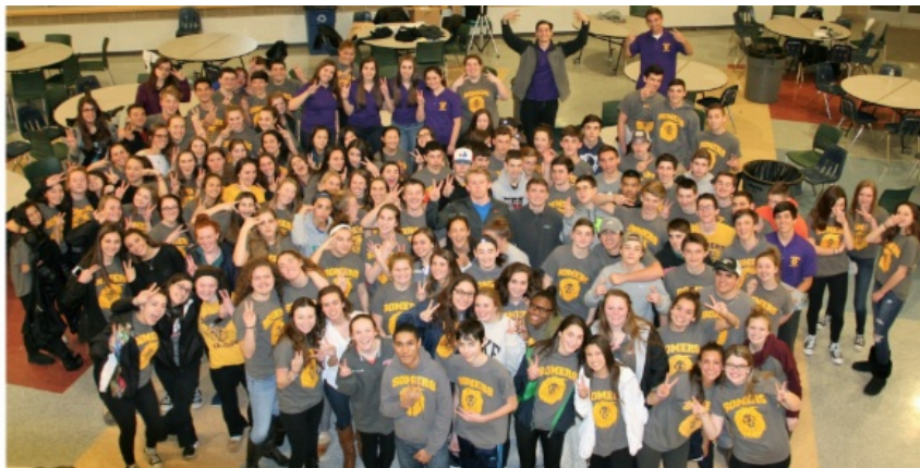
Leo Club members repairing a local home and gathering for a meeting

When the social workers in the Somers Central School District need assistance for a local family in need, they know exactly who to call.