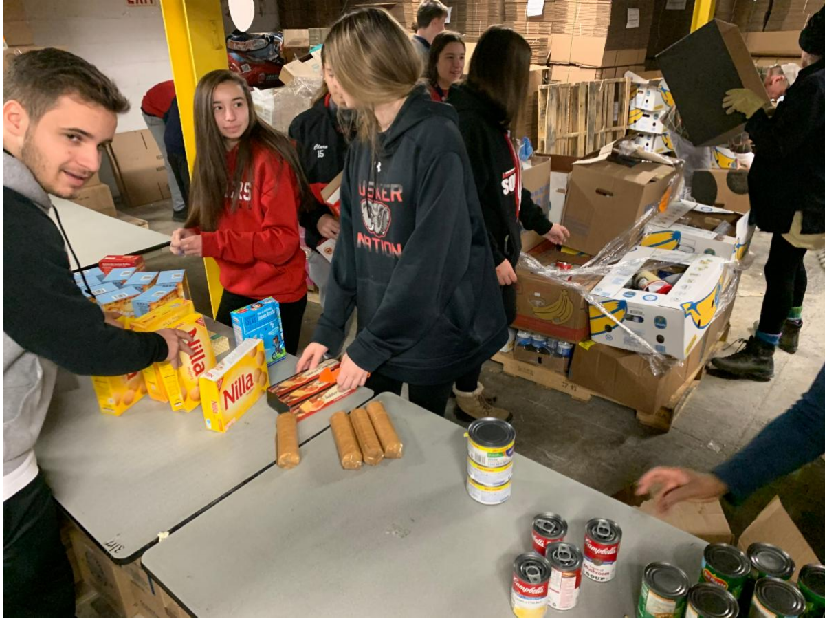
Dozens of high school students spent a Saturday morning helping sort and package food at the Food Bank of the Hudson Valley. Somers High School created this Annual Day of Service after the Sandy Hook Elementary School shooting, to remind students of the power of kindness and giving to others.