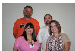
Cecil Manor Elementary School