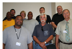
Perryville High School