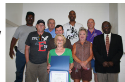
Elkton High School