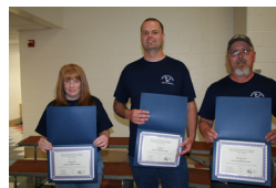
Calvert Elementary School

Past award recipients are Cherry Hill Middle, Bohemia Manor Middle, Rising Sun Middle, Calvert Elementary, Cecil Manor Elementary, Cecilton Elementary, Kenmore Elementary, North East Elementary, Bay View Elementary, Rising Sun High School, Bainbridge Elementary, Conowingo Elementary, Rising Sun Elementary, Elkton Middle, Charlestown Elementary, Leeds Elementary, Holly Hall Elementary, and Perryville Middle Schools. Cecilton Elementary, North East Elementary, Calvert Elementary, Cecil Manor Elementary, and Cherry Hill Middle Schools have all received two Superior ratings. We would like to commend all of our schools for their efforts.