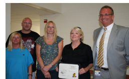
Cherry Hill Middle School