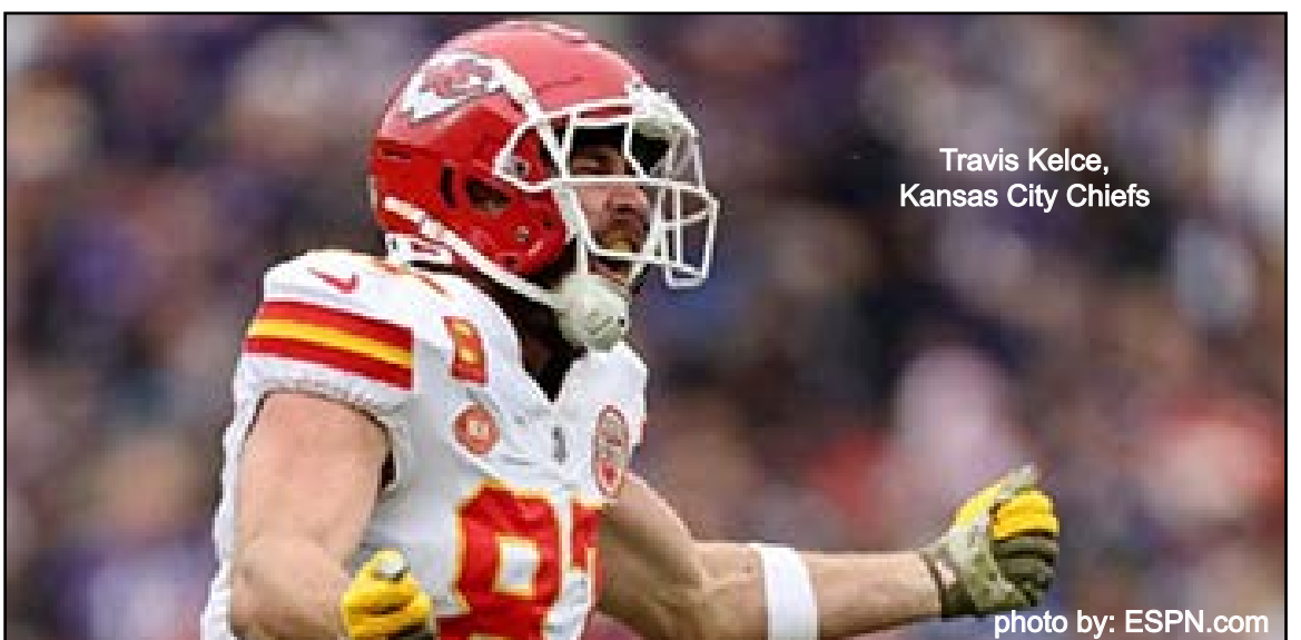
Travis Kelce, Kansas City Chiefs