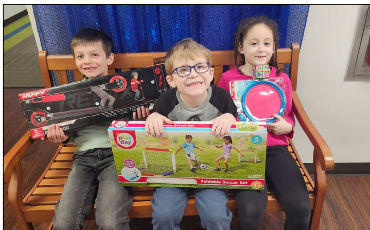
Prizes were handed out at each elementary school for the Read-a-thon. Pictured above are Hose Elementary students.

Students raised $7,034.40 which will be used to fund climate and culture activities for the students and staff at all three schools. Thank you to the students who participated and the parents and community members who made this a successful event. Keep reading Athenians!