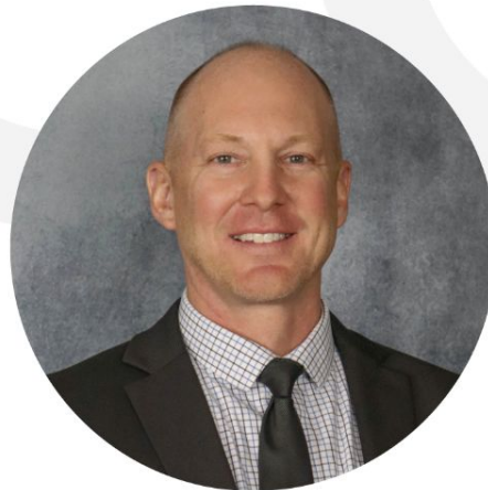
2024 NATIONAL PRINCIPAL OF THE YEAR