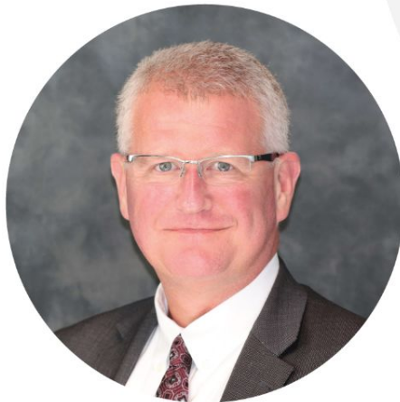
2024 STATE SUPERINTENDENT OF THE YEAR