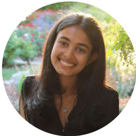
2023 PRESIDENTIAL SCHOLAR