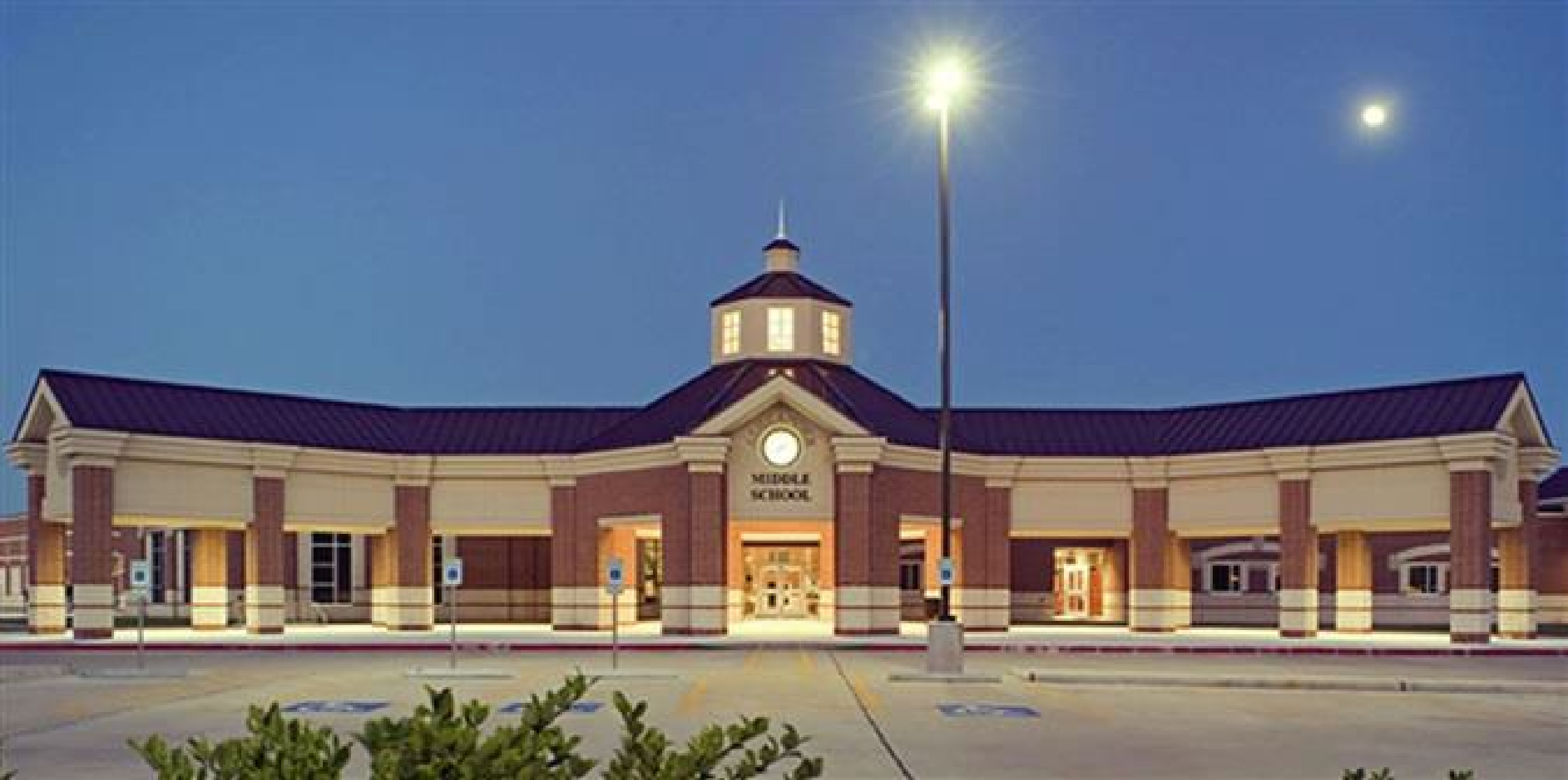
Alexander Middle School