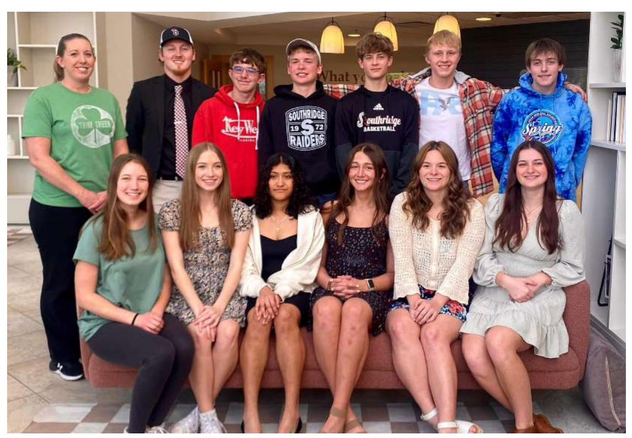
Pictured above is the Southridge swim team at their swim banquet, which was held at OFS Headquarters.