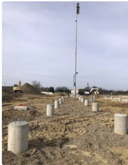
Home Grandstand Foundation