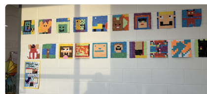
2nd Grade Minecraft Pixel Art