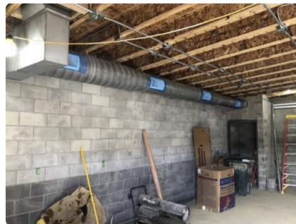
Interior of Concession Stand, Installed HVAC and Electrical