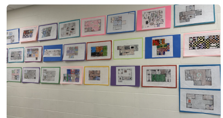
5th Grade Interior Design Drawings