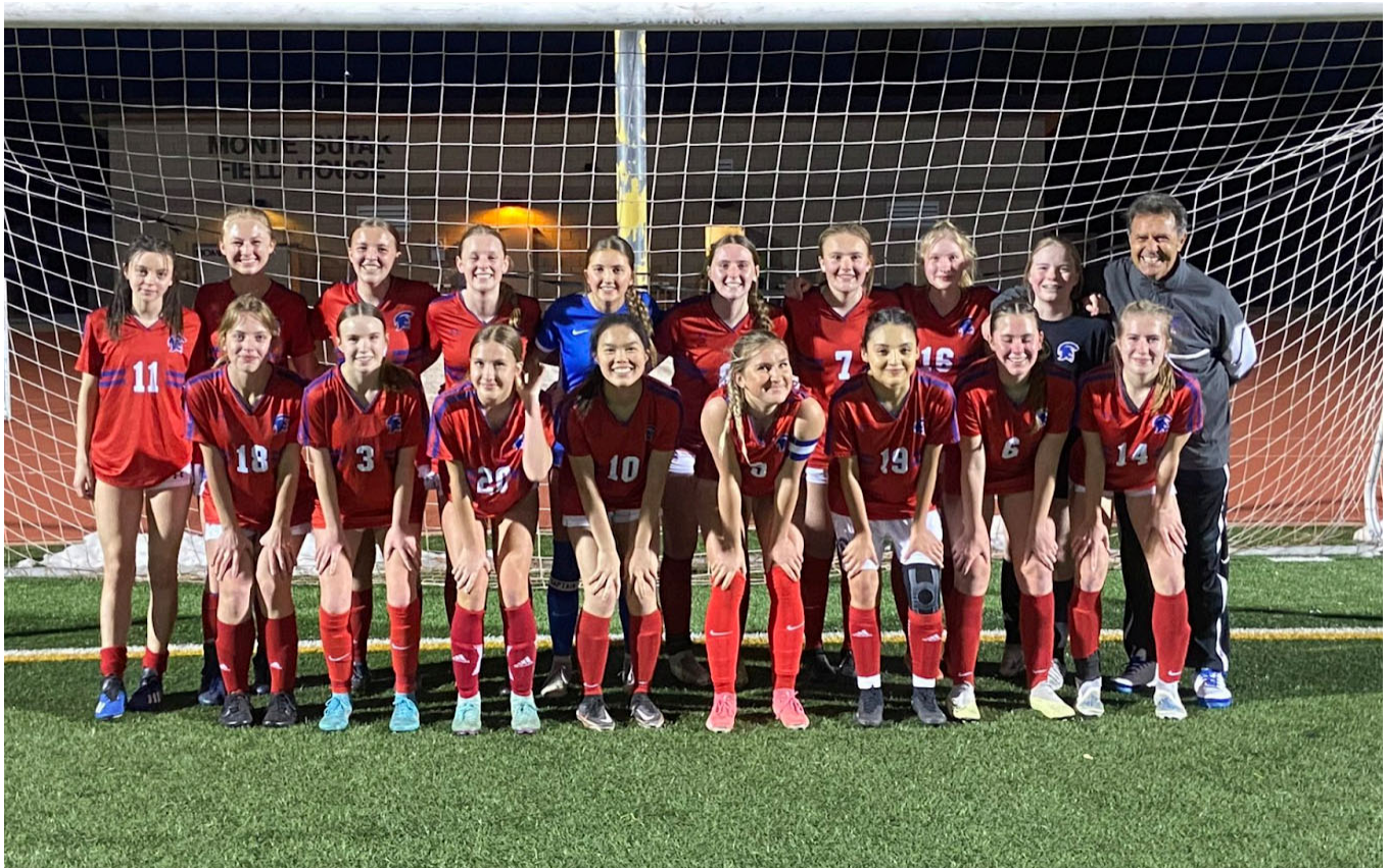
Our girls soccer team picked up their first victory of the season with a 5-2 home victory over George Washington!