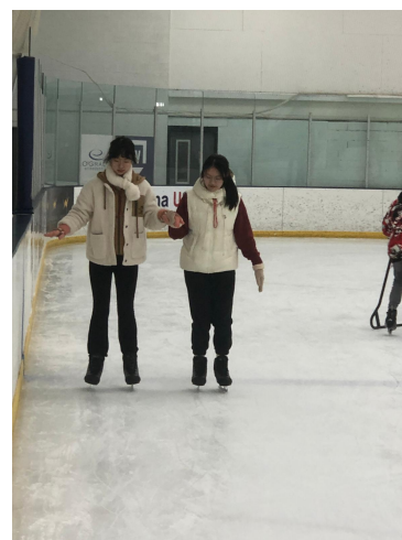
Skates, Dates, and Mates Valentine Skate: On Tuesday, February 13th our Hospitality and Inclusion branch of Student Congress held a skating party at our ice rink open to all students. We had several ISP students join in on this fun afternoon event!