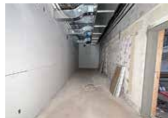
Sheetrock in the gym area has begun.

Our construction partners have done so much in such a short time, and it's exciting watching this school come together! While we're on track to have the school completed in the winter months of next school year as planned, a change has been made to the move-in schedule. Initially, we were hopeful that the school would be complete in time for a winter break move-in, however, with the potential for delays in the rainy season, scholars