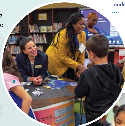
During DiscoverU week, FWPS scholars explored college and career opportunities with themed days and activities. These Twin Lakes Elementary scholars learned about jobs in FWPS during a college and career fair at their school!

Computer Science Education Week challenged scholars of all grade levels and coding experience to level up their coding skills with Hour of Code.