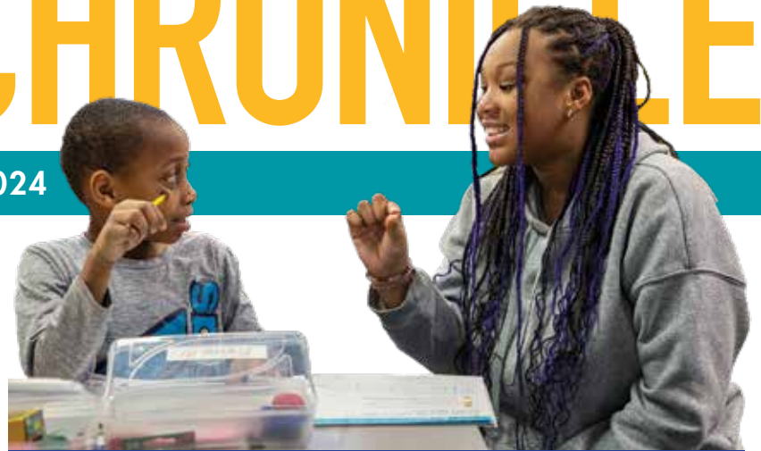
In the Child Development class, a TBHS scholar puts their learning into action to support elementary students at the nearby Enterprise Elementary School.