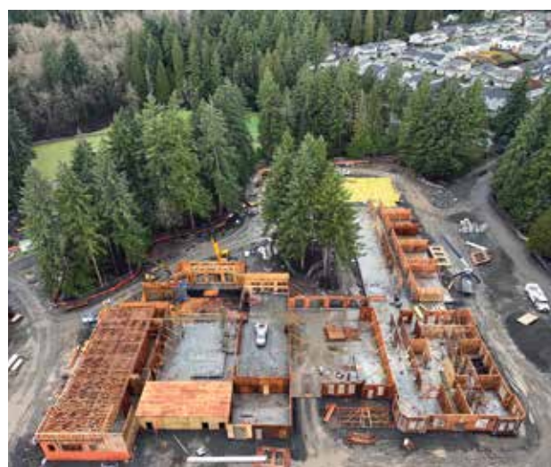
Aerial photo looking NW.

Our construction partners have done so much in such a short time, and it's exciting watching this school come together! While we're on track to have the school completed in the winter months of next school year as planned, a change has been made to the move-in schedule. Initially, we were hopeful that the school would be complete in time for a winter break move-in, however, with the potential for delays in the rainy season, scholars