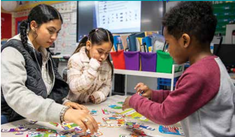
In Teacher Academy, scholars partner with a local elementary school teacher and learn skills needed to work in the field of education. Learn more: www.fwps.org/CTE