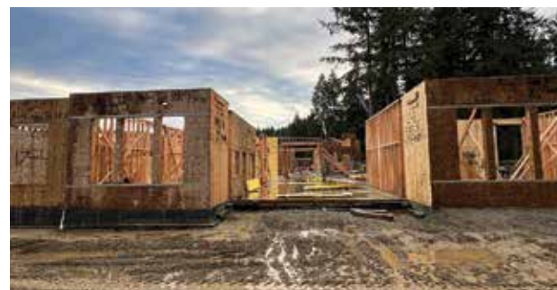
Wood framing at the main entry by the classroom wing.