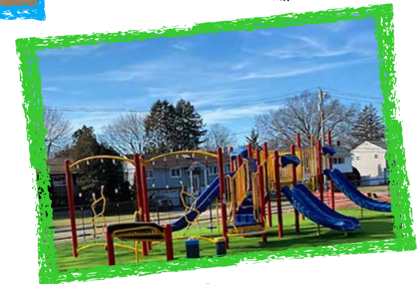
The new playground at Denton.