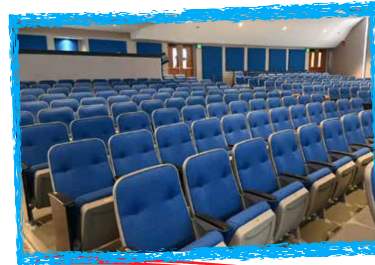
The renovated auditorium at Herricks High School included new seats, a refinished stage and new curtains.