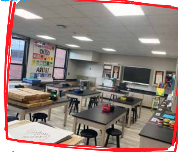
Art rooms throughout the district have been renovated. Pictured is the new art room at Center Street.