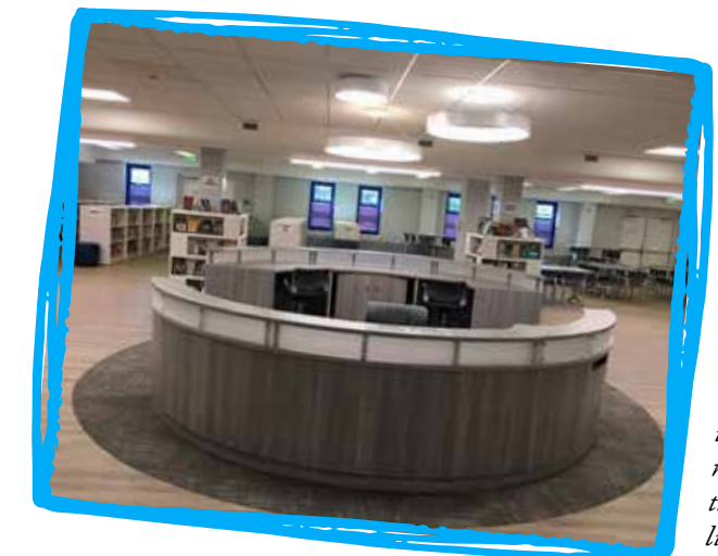
Improvements have also included the renovation of the high school library.