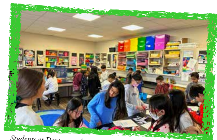
Students at Denton work on projects in the school's new art room.