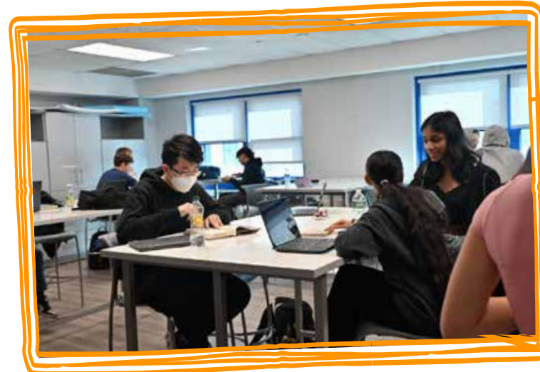
Herricks High School students collaborate in the school's new innovative classroom, a part of the renovated library.