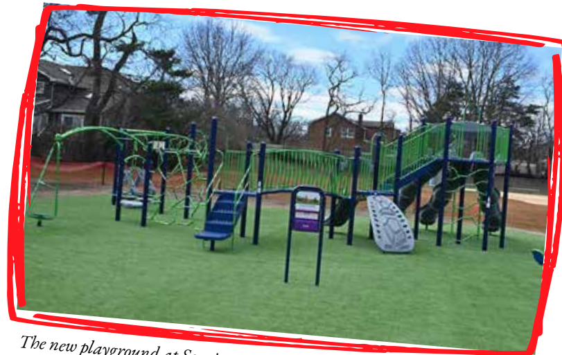
The new playground at Searingtown.